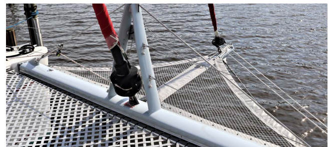
Odalisque Catana 431