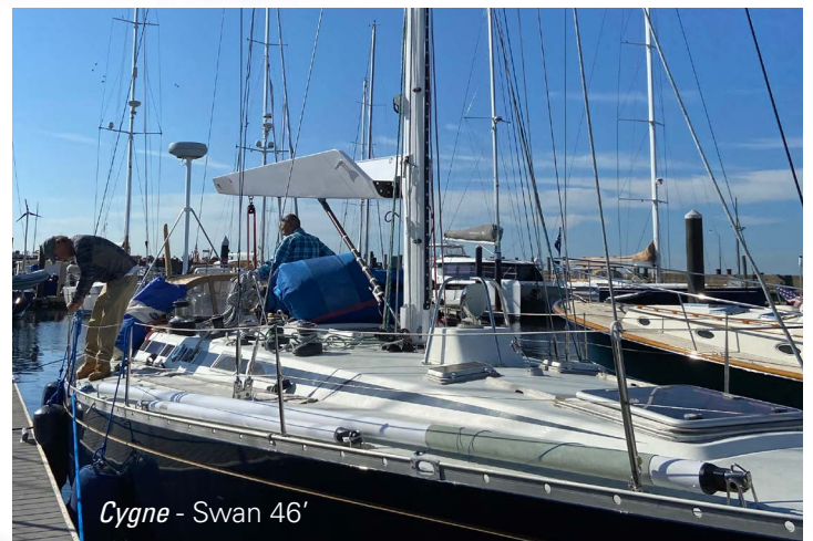
Cygne - Swan 46'