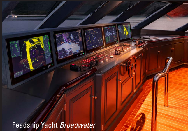
Feadship Yacht Broadwater