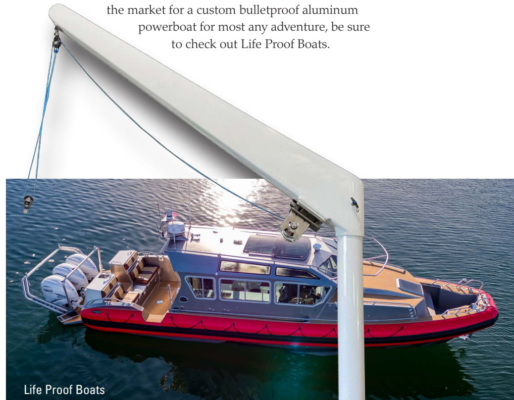
Life Proof Boats

A long time customer of GMT had a new custom boat built at Life Proof Boats in Bremerton, Washington. He needed a lightweight removable dinghy davit hoist to lift his tender into storage above the outboards. A custom carbon solution from GMT was the answer. We worked with the builders and the owner to design a solution that would function as needed and be light for ease of handling. If anyone is in the market for a custom bulletproof aluminum powerboat for most any adventure, be sure to check out Life Proof Boats.